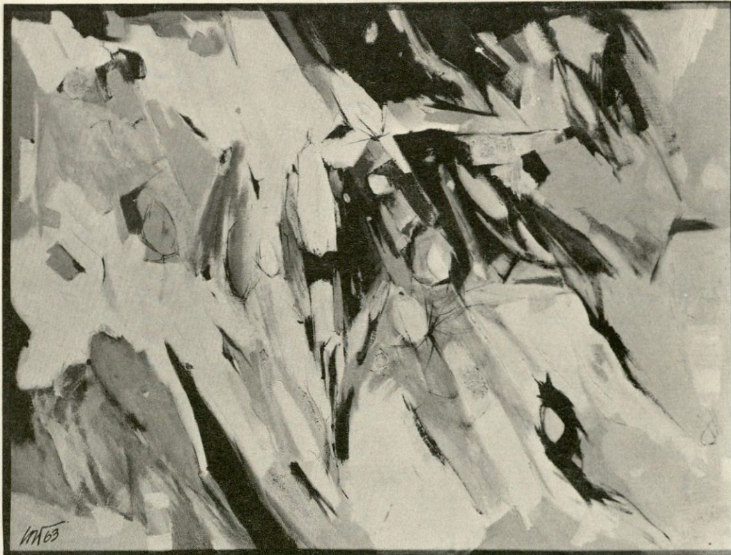
Autumn Snow, 41 x 28½, Oil, 1963

An Exhibition of Paintings and Drawings Library Gallery, Harpur College, State University of New York, Binghamton, New York